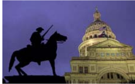
The Texas Capitol building in Austin at dusk

The following are brief overviews of some of the Texas statutes concerning legal issues that often arise when caring for children and adolescents with HIV. When possible, web sites with more information have been added. Most of the information here has been obtained from the Texas Department of Health and/or the Texas statutes.